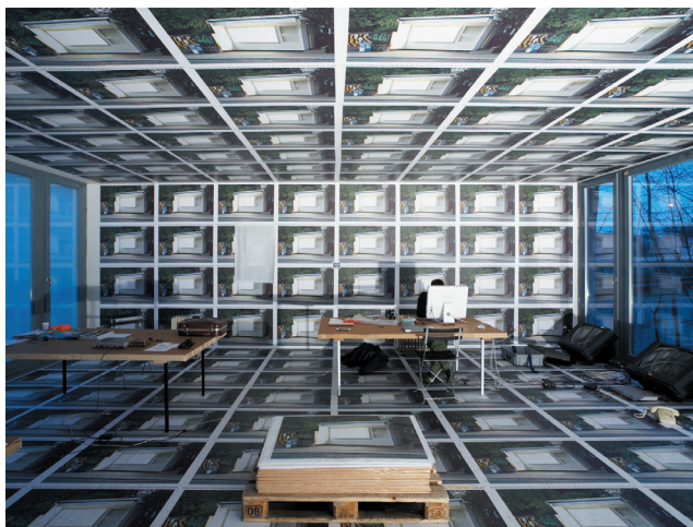
Rauminstallation Office and Laboratory at STAGE, Stadtgalerie Bern, 2006

Vernissage Marks Blond Project: 8. Dezember 2006